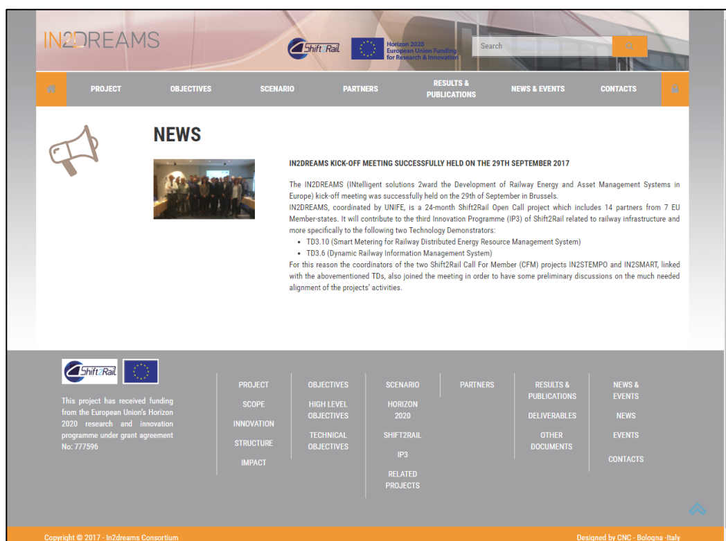
Figure 4: Screenshot showing the news section of the IN2DREAMS website

This section is used to provide information about the latest news and events concerning the IN2DREAMS project, including announcements and press releases about public events which have been organised during the project lifetime or will be organised in the future.