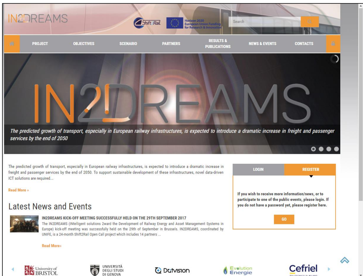
Figure 1 : Homepage of the IN2DREAMS website

The webpage is managed by the coordinator of the project which will ensure that documents and news are uploaded regularly. The webpage will be maintained during the lifetime of the project and will be active with the latest information at least three years after the end of the project. The homepage of the website is depicted in the figure below.